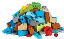
Pile of Legos

“I can give you my lightsaber. You can cut a hole in the box and get what you need,” Darth Vader answered. “When you are finished, the hole in the box will disappear. Then you will have everything you need, OK?”