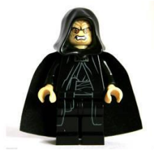
Lego Darth Sidious

“This is Darth Sidious. I have come to get revenge for what you have done to the Empire. You will pay a price. I am going to blow you out of the sky!” Darth Sidious threatened.