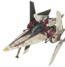
Ray Wing Fighter

He gave directions to everyone and they worked hard to make the Ray Wing Fighter the best design ever.