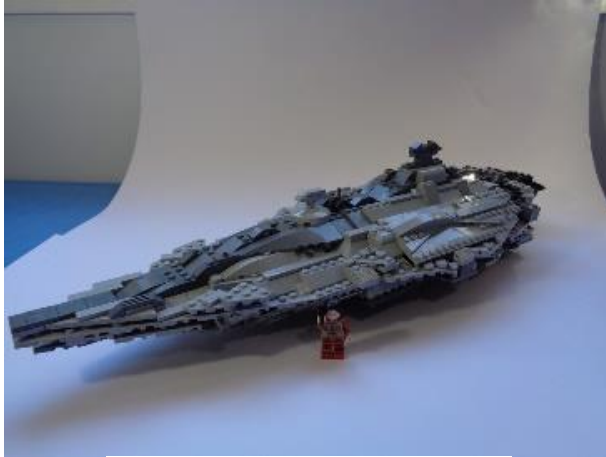
Raymond and the Star Cruiser

“WOW! That’s so garious!” Tony and Paul said together. “What are you going to do with it?”