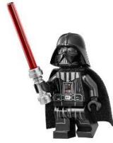
Lego Darth Vader

In the corner of his room, on a shelf, Raymond saw his Lego Darth Vader. It was talking to him.