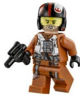
Commander Poe Demaron